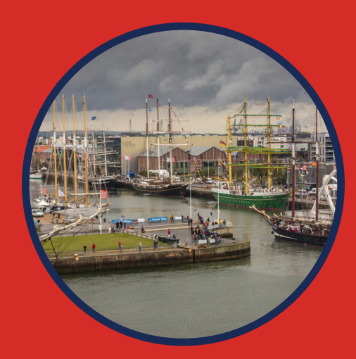
Le Havre: 4 July - 7 July

We are always looking for ports and cities interested in hosting our Events so please do get in touch if you would like to discuss applying to host the Tall Ships Races in 2026 or beyond (please contact Vanessa Mori at Vanessa.Mori@sailtraininginternational.org)