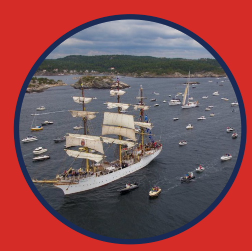
Kristiansand: 30 July - 2 August