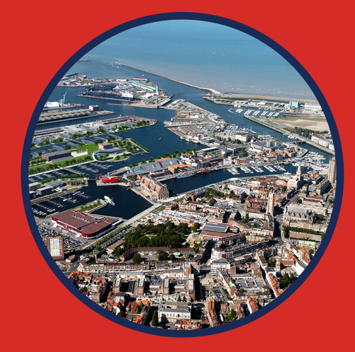
Dunkirk: 10 July - 13 July