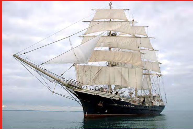
John's family were inspired to launch the bursary after seeing the Class A Tall Ship Tenacious (UK).

This year, we were able to support three fantastic projects run by Brigs Youth Sail Training ($5,000CAN), EcoMaris ($10,000CAN) and Adventure Under Sail ($5,000CAN).