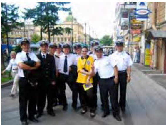
STI Conference, November 2009, Istanbul, Turkey