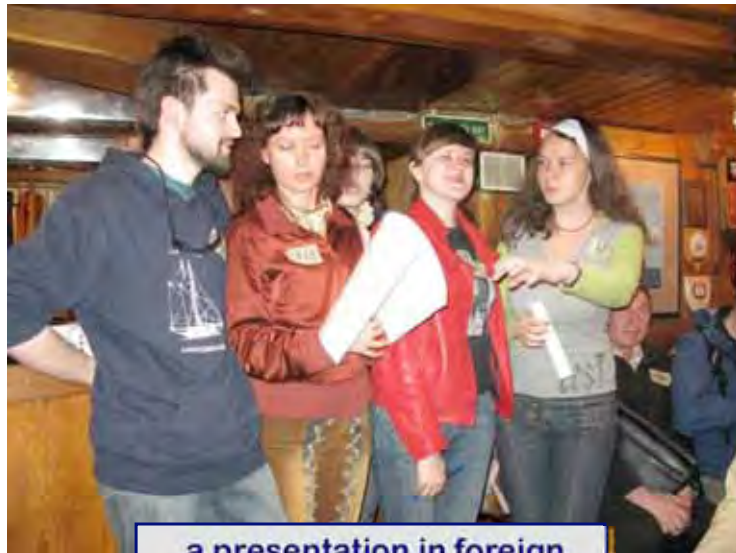
a presentation in foreign language