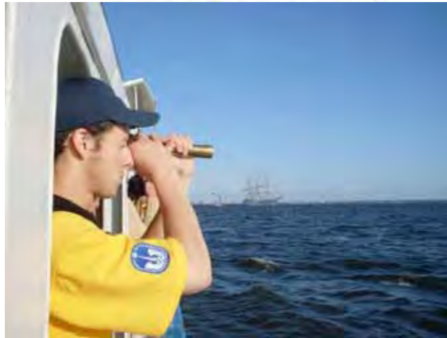
Watching Parade of sail: they deserved it

STI Conference, November 2009, Istanbul, Turkey