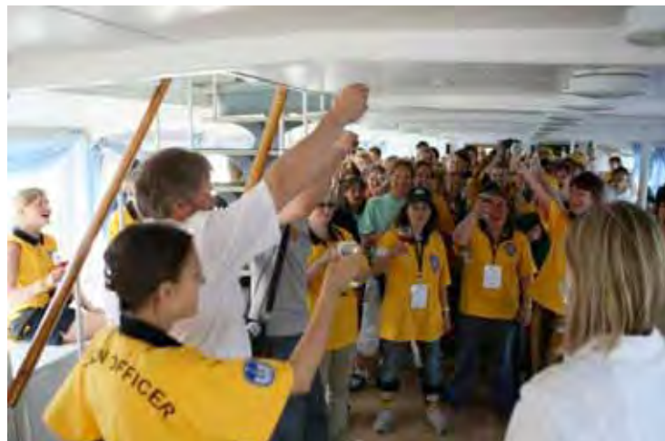
Watching Parade of sail: they deserved it

STI Conference, November 2009, Istanbul, Turkey