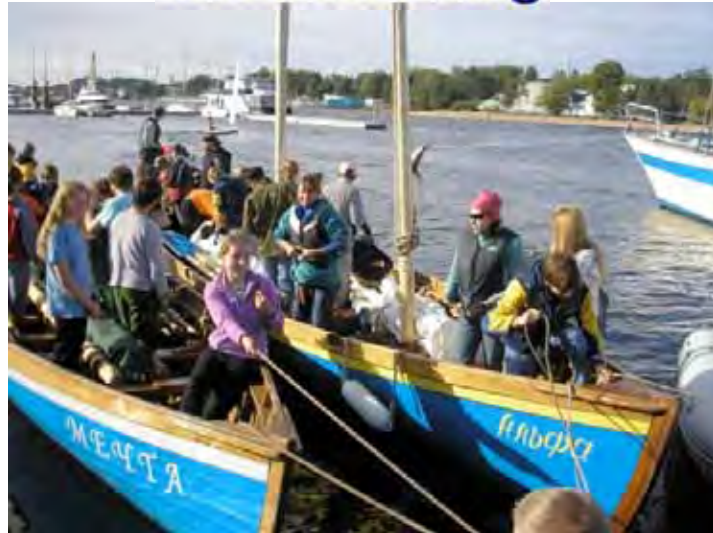
STI Conference, November 2009, Istanbul, Turkey