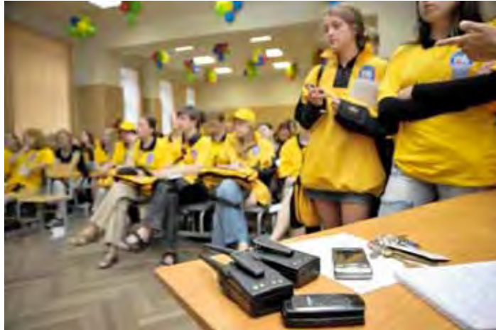
STI Conference, November 2009, Istanbul, Turkey