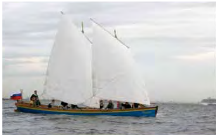
Teambuilding: practice in sailing and rowing

STI Conference, November 2009, Istanbul, Turkey