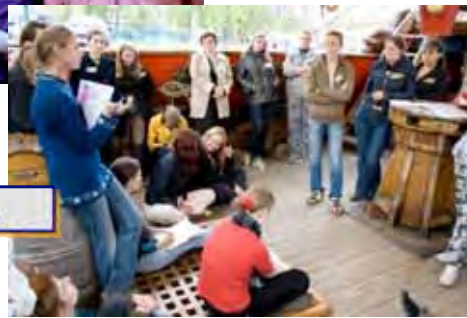
Work in small groups