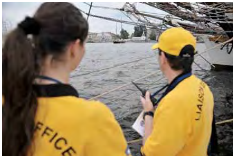
STI Conference, November 2009, Istanbul, Turkey