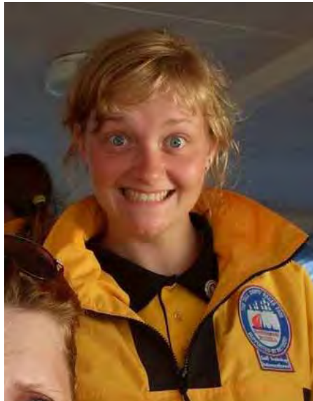
STI Conference, November 2009, Istanbul, Turkey