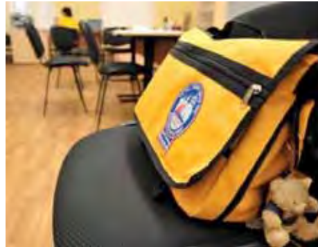
Shtandar Project, St. Petersburg