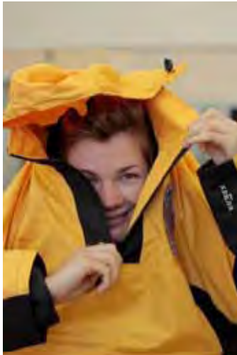
STI Conference, November 2009, Istanbul, Turkey