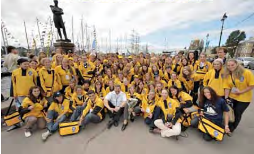
STI Conference, November 2009, Istanbul, Turkey