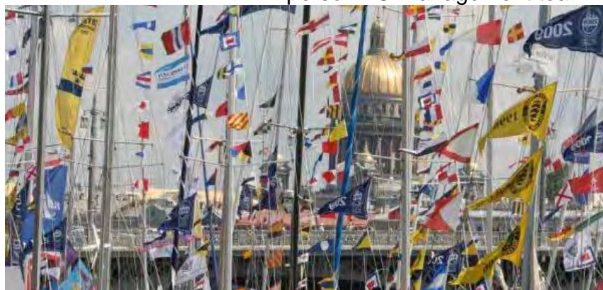
STI Conference, November 2009, Istanbul, Turkey