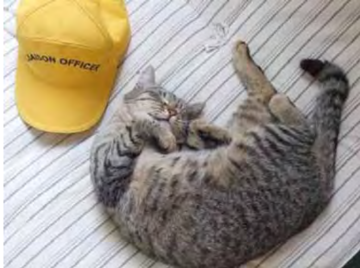
STI Conference, November 2009, Istanbul, Turkey