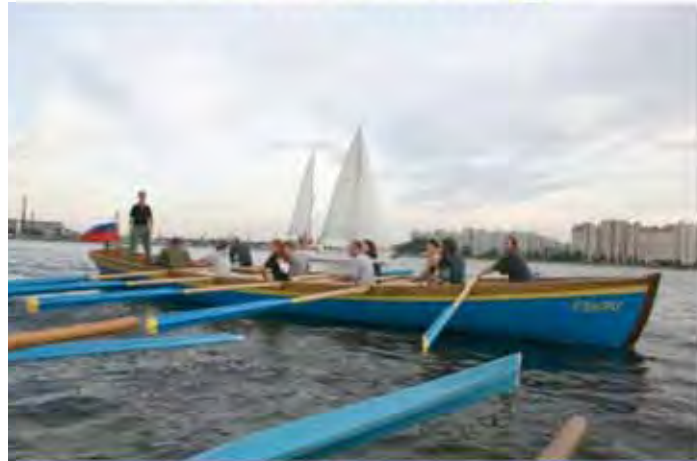
Teambuilding: practice in sailing and rowing

STI Conference, November 2009, Istanbul, Turkey