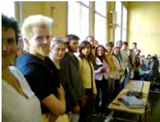
STI Conference, November 2009, Istanbul, Turkey