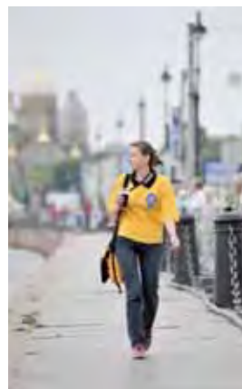
Shtandar Project, St. Petersburg