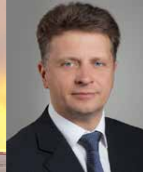
Maxim Sokolov Minister of Transport Russian Federation

We offer our partners a unique opportunity to help change young people's lives, while simultaneously engaging huge international audiences in support of their own objectives. I can assure you that the spirit and spectacle of this unique Regatta will generate a passionate response from all those it touches.